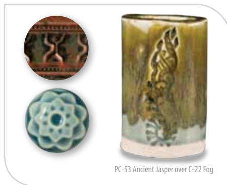
PC-53 Ancient Jasper over C-22 Fog