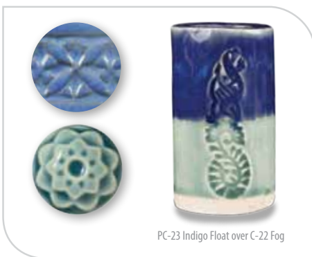
PC-23 Indigo Float over C-22 Fog