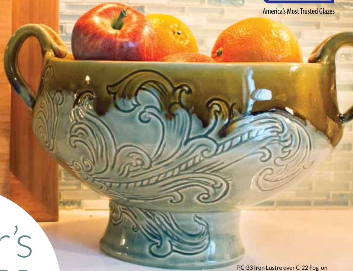
PC-33 Iron Lustre over C-22 Fog on AMACO 11-MA-Mix White Stoneware Clay