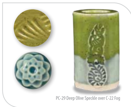
PC-29 Deep Olive Speckle over C-22 Fog