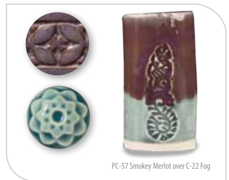
PC-57 Smokey Merlot over C-22 Fog