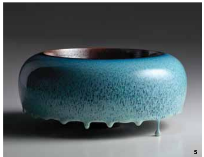
1 Ikuko Iwamoto's Pits IV (Framed Sculpture) , 24 in. (61 cm) in height, porcelain, metal wires, wood, glass. 2 Chris Keenan's bowls, 5½ in. (14 cm) in diameter, Limoges porcelain. 3 Sophie Cook's Matt Yellow Teardrop and Bottle , ceramic. 4 Daniel Smith's painted bowls, to 6 in. (15 cm) in diameter. 5 Thomas Bohle's vessel, 9 in. (24 cm) in diameter, ceramic, barium glaze. 1–5 Courtesy of Ceramic Art London. "Ceramic Art London" at Central St. Martins, ( http://www.ceramics.org.uk/index.php ) in London, England, April 8–10, 2016.