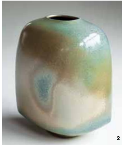
1 Rafael Pérez' sculpture, ceramic. "Seeing: Rafael Pérez," at Contemporary Ceramics Centre ( www.cpaceramics.com ) in London, England, April 7–May 7. 2 Ruth King's soft oblong vessel, 10½ in. (27 cm) in height, ceramic. "Ruth King: Solo Exhibition," at Contemporary Ceramics Centre ( www.cpaceramics.com ) in London, England, May 12–June 4. 3 Erica Iman Paternoster Series I , 17 in. (43 cm) in length, porcelain, glaze, wire, 2012. 4 J.J. McCracken's Thirst and the Martyr , endurance performance, soundscape, 2007. 5 Christina West's Core #2 , 16½ in. (42 cm) in height, pigmented hydrocal, 2014. "Artaxis + Northern Clay Center Exhibition," at Emily Galusha Gallery, Northern Clay Center ( www.northernclaycenter.org ), in Minneapolis, Minnesota, through April 24.