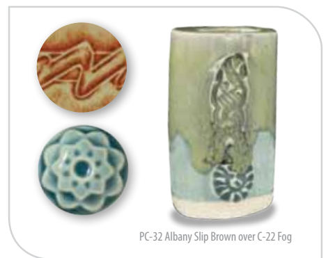
PC-32 Albany Slip Brown over C-22 Fog