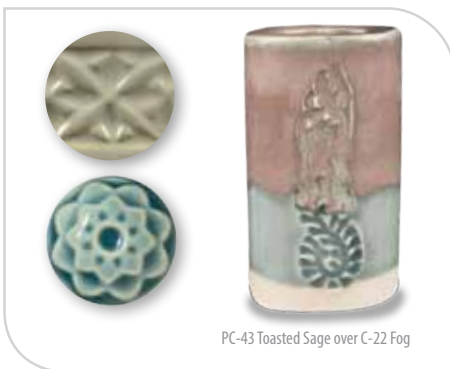
PC-43 Toasted Sage over C-22 Fog